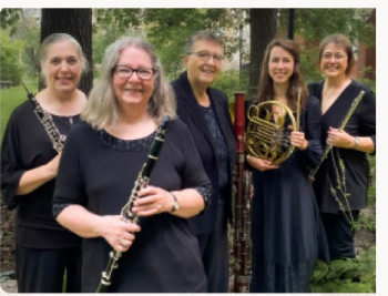
The Equinox Chamber Players will delight audiences with a mix of classical favorites.