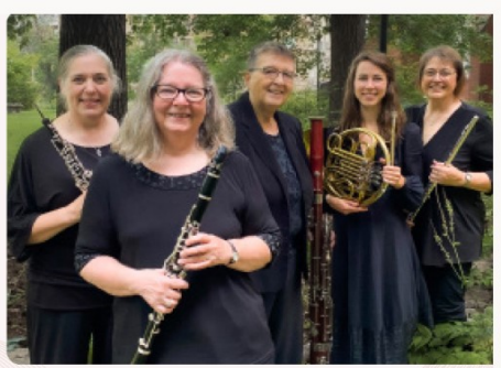
The Equinox Chamber Players will delight audiences with a mix of classical favorites.